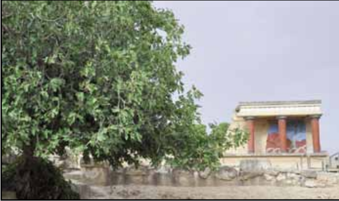
Large fig tree dominates this cultic area at Knossos, Crete. Note the Minoan column architecture and painted fresco.