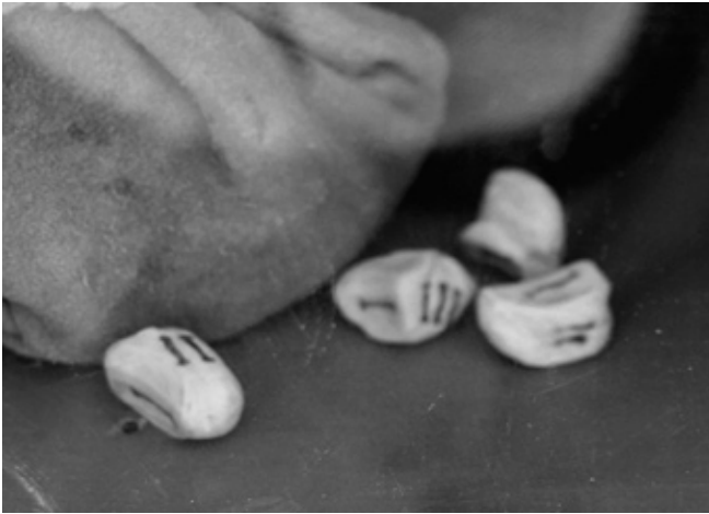
Cow's Knuckles Used to Cast Lots

this first big decision as a problem within...let's draw lots to replace Judas. Lots fell upon Matthias.